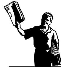
Working with Villagers